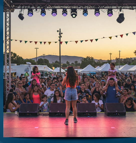
MAIN STAGE LIVE PERFORMANCES