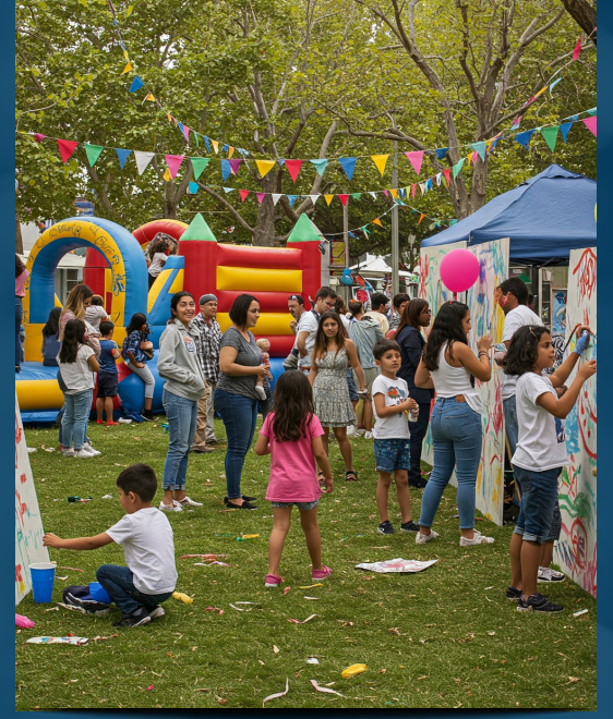
FAMILY FUN ZONES